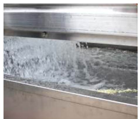
Slag barrier & Circulating water tank