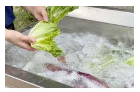
High pressure bubble function