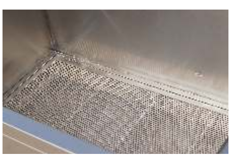
Orifice plate can be lifted up