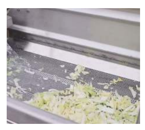
Vibration conveying mechanism