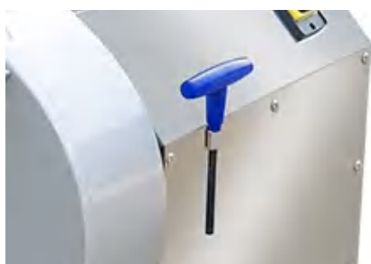
Specialized blade tool