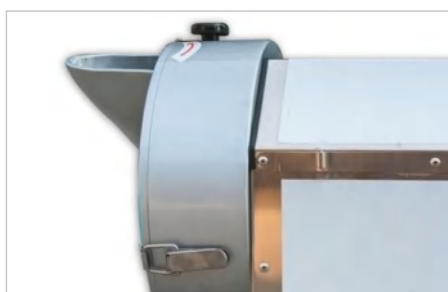
User friendly feed port