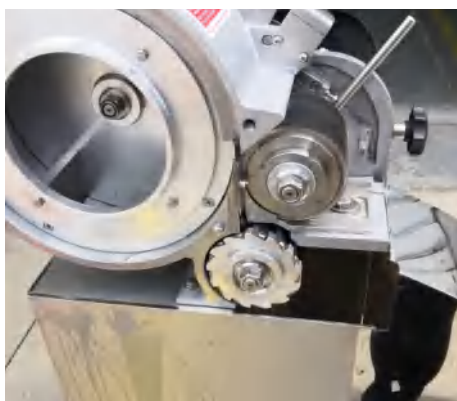
Structure of DS-075D