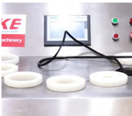
Different size feed port