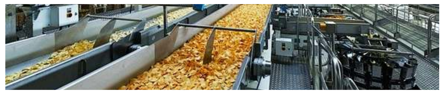
Potato chips processing line. from peeling to packing