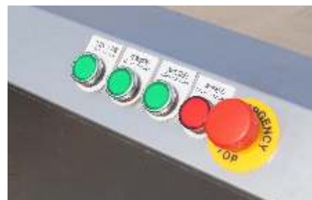
Safety waterproof buttons