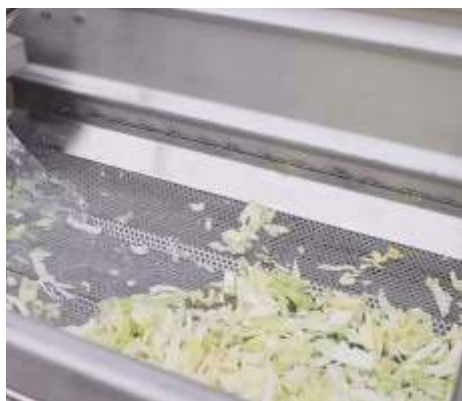
Vibration conveying mechanism