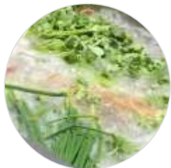
Leaf Vegetables Cleaning

IKE Bubble Washing Machine is mainly used for vegetables and fruits cleaning. It imitates human washing motion. It can help us to reduce labor cost and improve work efficiency. The washing machine has ozone disinfection function to kill the bacteria and oxidize pesticides too. It is a perfect equipment for food processing, catering, supermarkets and other industries.