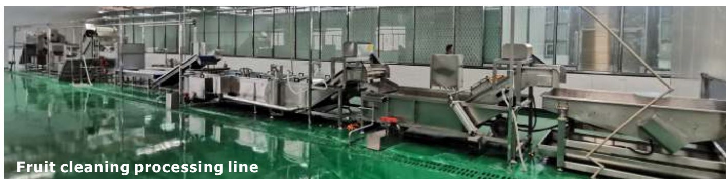
Fruit cleaning processing line