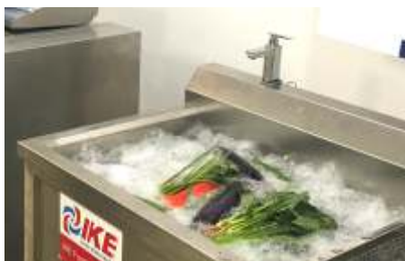
High pressure bubble function