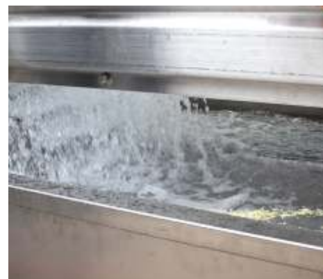
Slag barrier & Circulating water tank