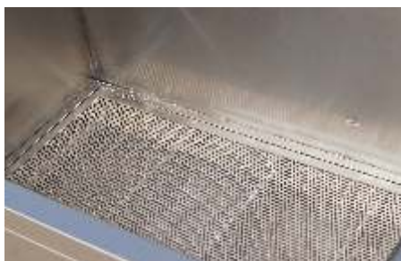
Orifice plate can be lifted up